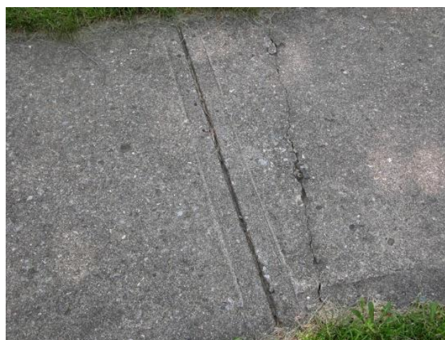
Figure 5 A crack next to a too-shallow joint

In order to diminish the likelihood of early random cracking, these joints should be placed exactly after the concrete casting. If the control joint is not deep enough, the concrete can crack near it instead of in it. For a crack control joint to be effective, it should be \frac{1}{4} as deep as the slab is thick. That is, on a typical four inch thick slab, the joints should be no less than one inch deep; a six inch thick slab would require 1.5 inch deep joints, etc. (See Figure 5).