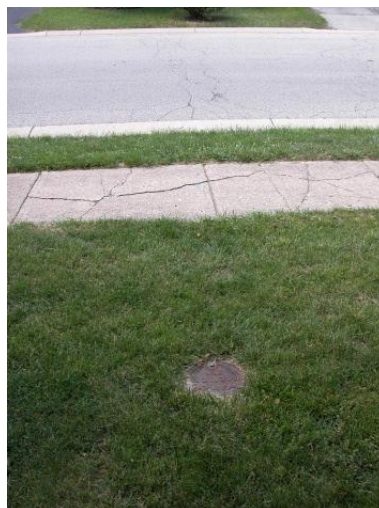
Figure 8 Note the cracks in the sidewalk and street over this poorly compacted water line trench.

Conversely, if a large tree is removed from near a concrete slab the buried roots will decompose. The resulting void can cause the ground to settle and the concrete to crack. Settling is also called subsidence. Subsidence is very common over trenches where utility lines and plumbing pipes are buried. Often times, the utility trench is not compacted when it is refilled. If concrete is placed atop a poorly compacted trench, the void created by subsidence can cause a crack across the unsupported concrete slab (See Figure8).