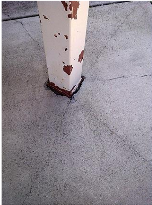
Figure2 Shrinkage cracks originating at re-entrant corners

Another imperfection evidenced in the middle of a slab which can create the same defect as re-entrant corner would be circular objects. This phenomenon can be frequently observed around slab penetrations including, drains, manhole, pipe frames and plumbing fixtures. The concrete cannot shrink smaller than the object it is poured around, and this causes enough stress to crack the concrete. (see figure 3).