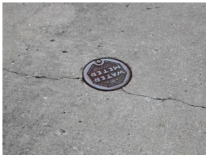
Figure3 Shrinkage crack at slab penetration.

Another imperfection evidenced in the middle of a slab which can create the same defect as re-entrant corner would be circular objects. This phenomenon can be frequently observed around slab penetrations including, drains, manhole, pipe frames and plumbing fixtures. The concrete cannot shrink smaller than the object it is poured around, and this causes enough stress to crack the concrete. (see figure 3).