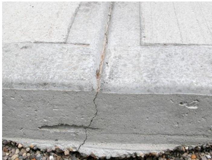
Figure 4 A successful crack control joint.

They are simply grooves that are tooled into fresh concrete, or sawed into the slab soon after the concrete reaches its initial set. Control joints create a weak place in the slab so that when the concrete shrinks, it will crack in the joint instead of randomly across the slab (See Fig.4).