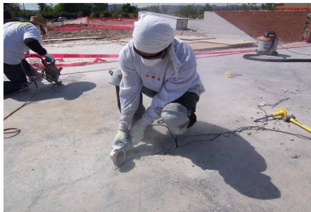
Fig.11 crack repairing.