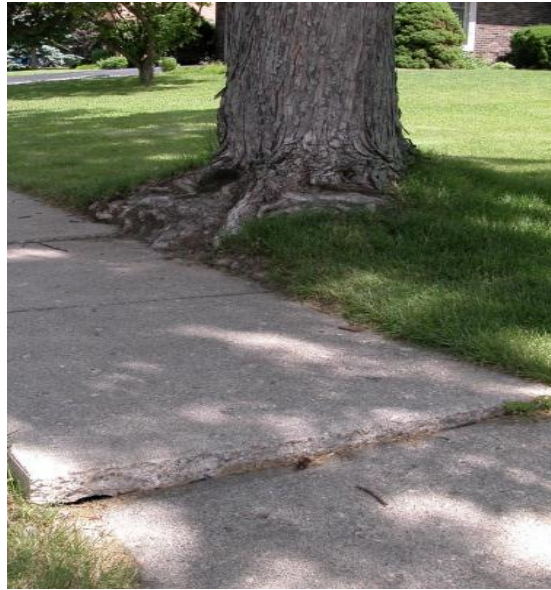
Figure 7 Tree roots lifted and cracked this sidewalk