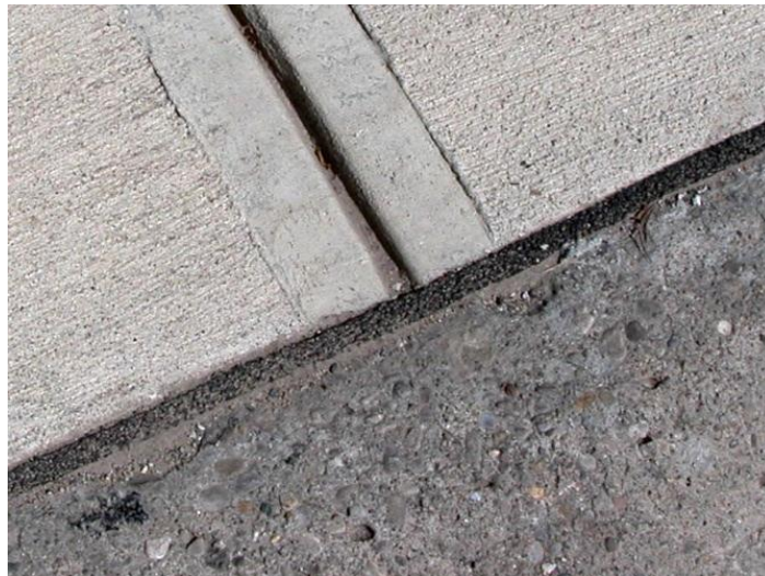
Figure 6 Foam expansion joint separating driveway and curb.

Two separate surfaces can be subdivided by an isolation joint or expansion joint as a boarder. Its entire depth is filled with some type of compressible material such as tar-impregnated cellulose fiber, closed-cell poly foam, or even lumber (See Figure 6).