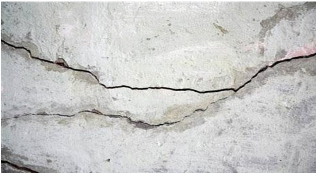
Fig.1 Cracking of concrete

Cracking of concrete (Fig. 1 ) is a frequent complaint. Cracking is caused by restraint (internal or external) of volume change, commonly brought about by a combination of factors such as drying shrinkage, thermal contraction, curling, settlement of the soil-support system, and applied loads. Cracking can be significantly reduced when the causes are understood and preventive steps are taken.